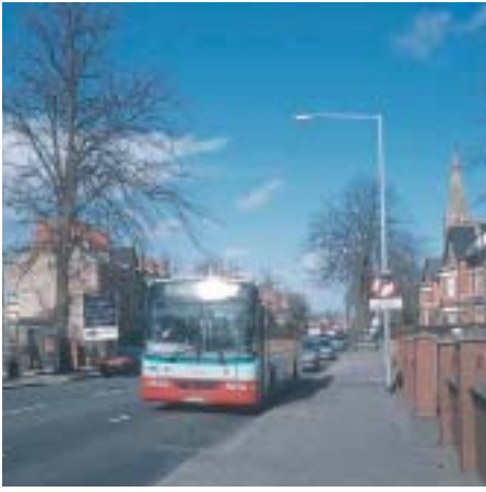
Linkage with public transport network.