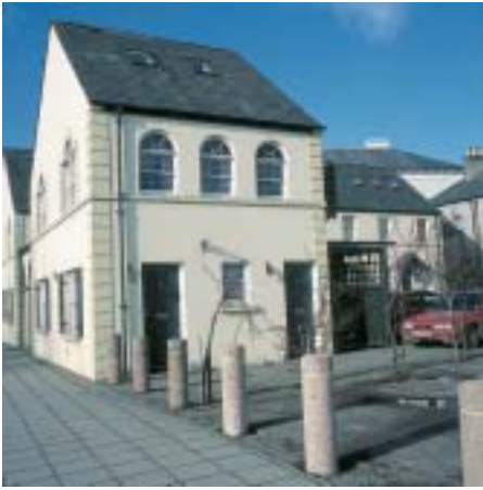
Enniskillen, County Fermanagh

achievement setting an ambitious regional target of 60% for the period up to 2010.