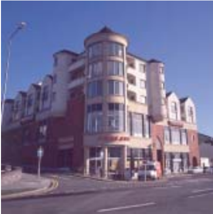
Mixed use development integrated with the surrounding community. Enniskillen, County Fermanagh