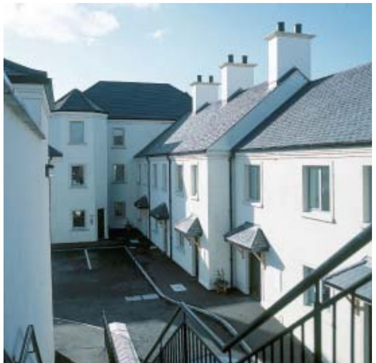
Enniskillen, County Fermanagh