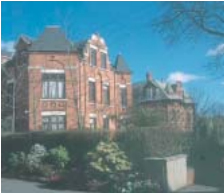
Successful conversion of large house into apartments. South Belfast

subject to suitable mechanical ventilation. Proposals must also demonstrate satisfactory arrangements for access.