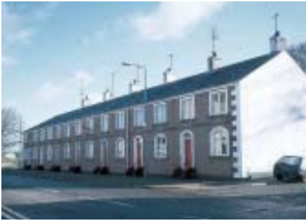
Enniskillen, County Fermanagh