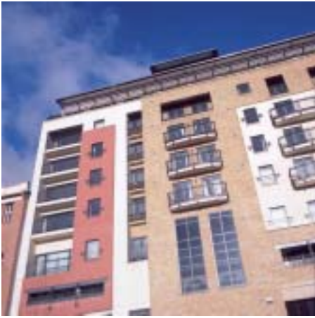
Well designed apartment development. Belfast City Centre