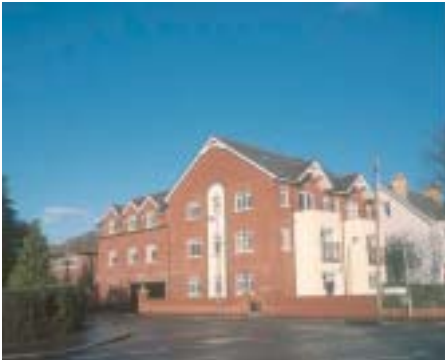
Demolition and redevelopment of a corner site. East Belfast