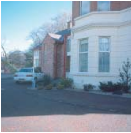
Conversion with in-curtilage car parking reducing the need to park on-street. South Belfast

some combination of these options. The optimum solution will depend on the dimensions of the plot (particularly in relation to front of plot provision), the presence of mature trees, which should be retained, and the capacity of the street to accommodate on-street car parking.