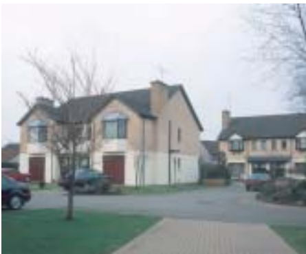
Backland development achieving continuity in design and character. Ballymena, County Antrim

The threshold between the new development and surrounding streets requires very careful attention. The aim must be to achieve continuity in design and character in terms of both the streetscape and landscape. It should not simply be seen as an add-on or solely a road engineering issue.