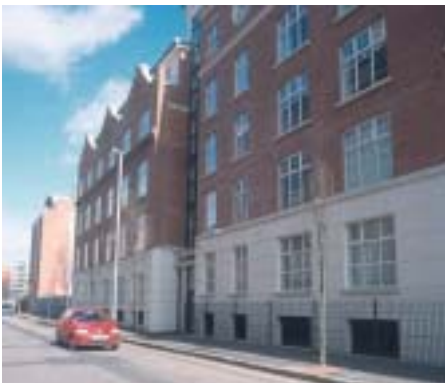
Semi-basement car parking. Belfast City Centre