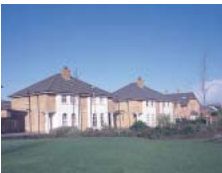
Good provision of amenity space. East Belfast