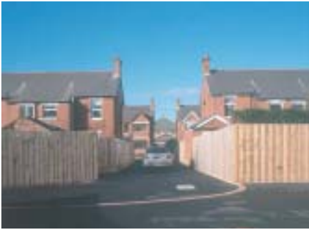
Access to backland development impacting on streetscape. East Belfast

scale and massing of new housing in backland areas should not exceed that of the existing dwellings fronting the surrounding streets.