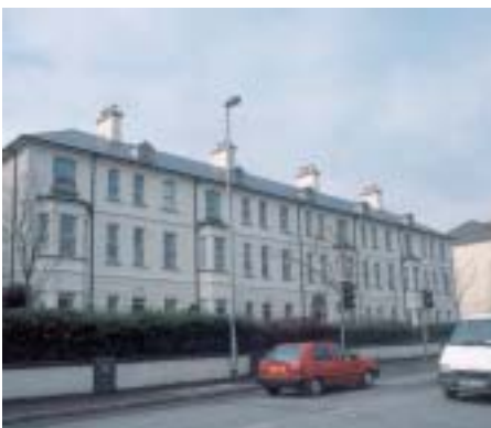
Making a positive contribution to the surrounding streetscape. Londonderry

‘the Department considers that an analysis of context is particularly important for infill housing, backland development or redevelopment schemes in established residential areas.’