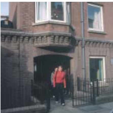
Pedestrian accessibility. Londonderry