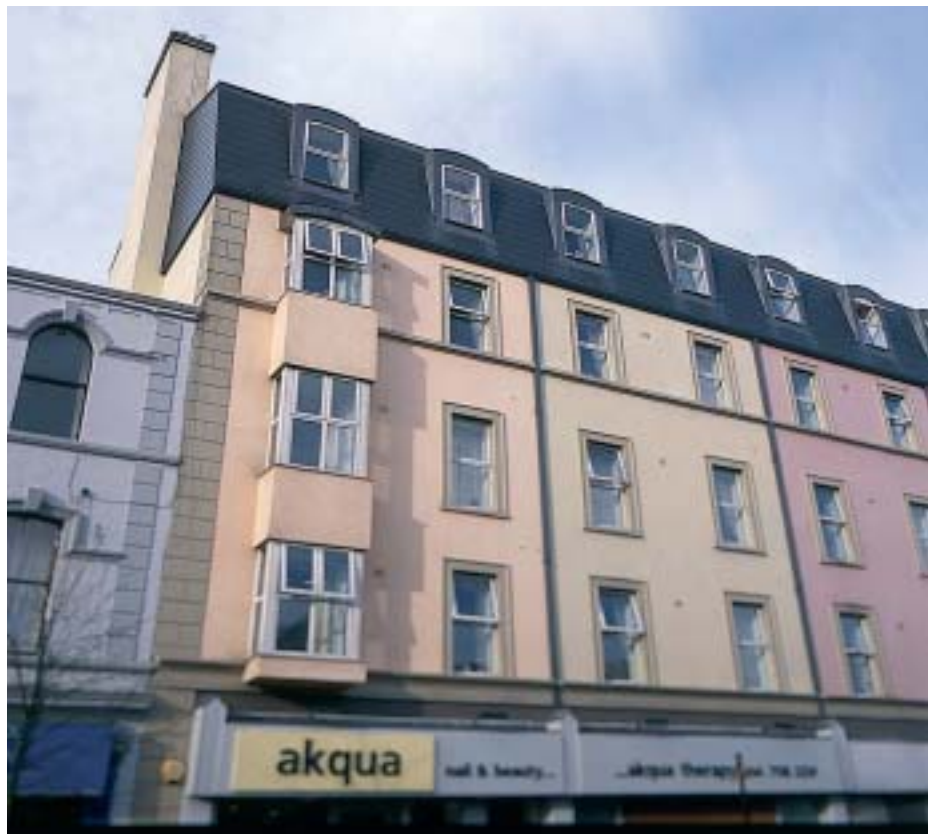
Successful provision of residential accommodation over shops. Londonderry

5.19 Living Over The Shop can make a small but valuable contribution to the promotion of high-density development. However, such forms of mixed use do not suit all tenants (e.g. families and special needs groups).