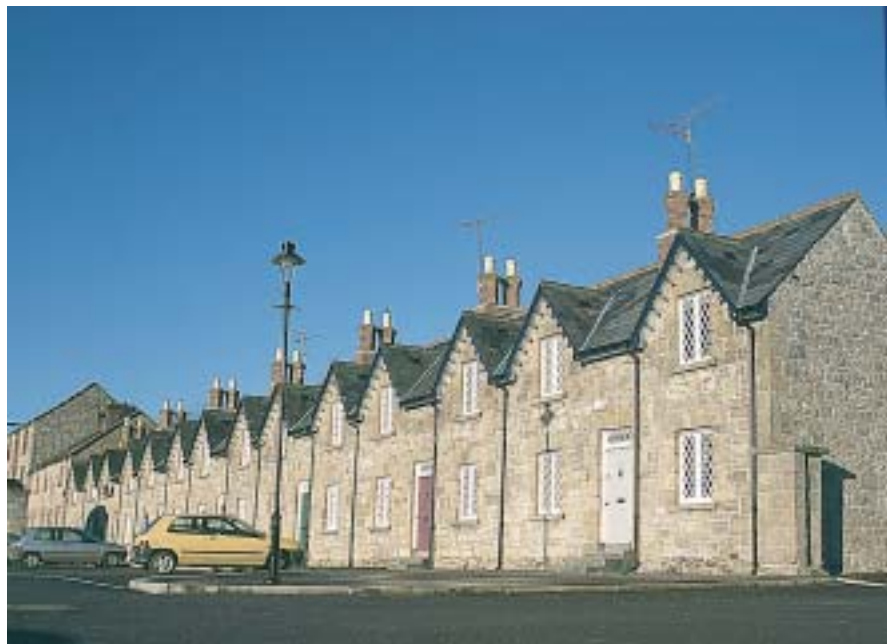
Building on local character and identity. Caledon, County Tyrone