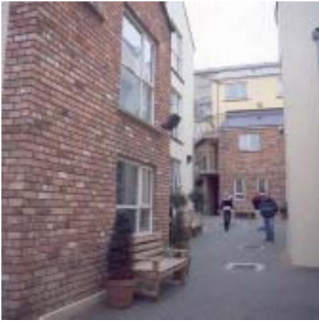
Achieving a secure environment. Londonderry