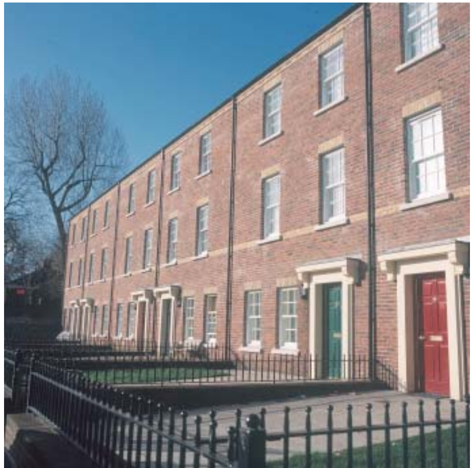
Reduced car parking provision. Belfast City Centre