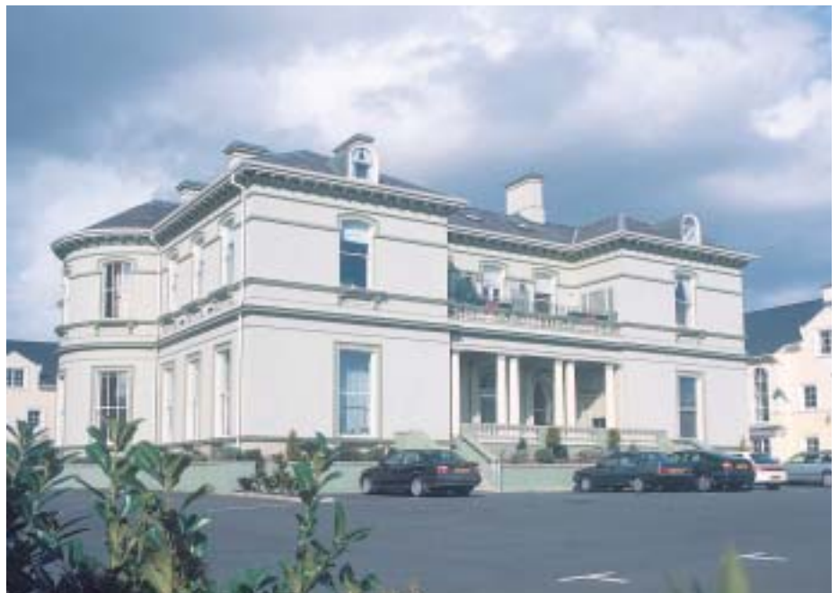
Conversion with car parking provision. Lisburn, County Antrim