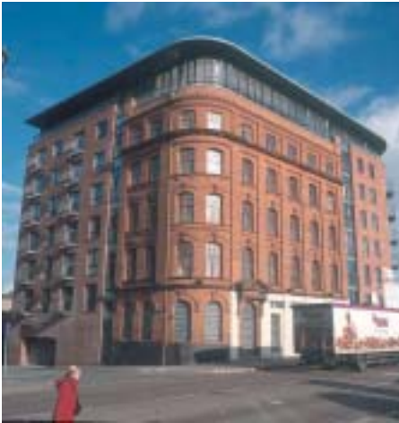
Belfast City Centre