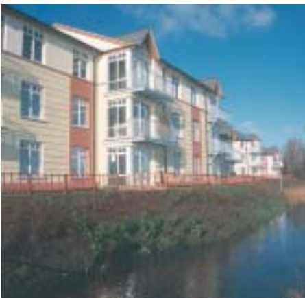
Enniskillen, County Fermanagh