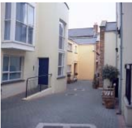
Car free housing. Londonderry