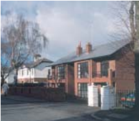
New housing integrated into the established urban environment. South Belfast