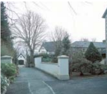
Backland development which respects local context. Ballymena, County Antrim