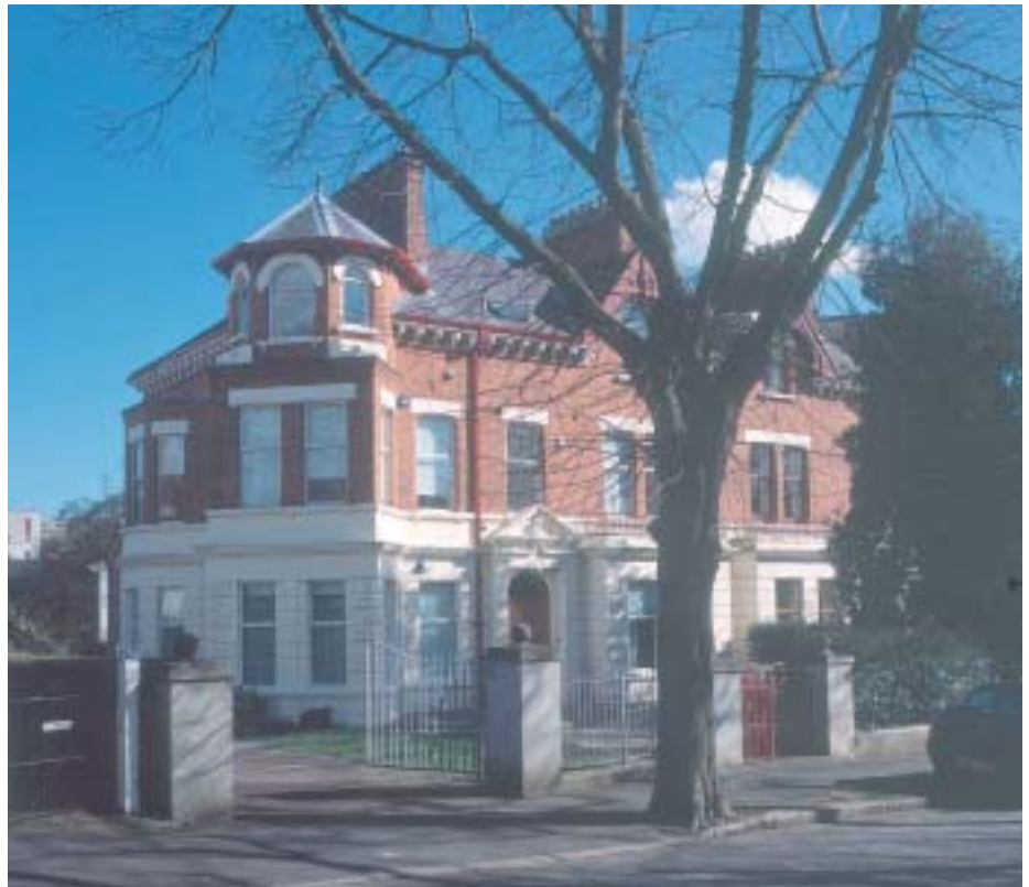
Conversion which harmonises with adjacent properties. South Belfast