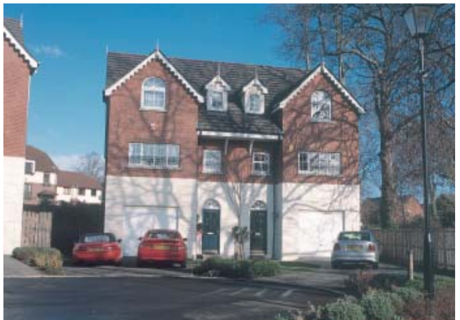
Town houses with integral garages. East Belfast