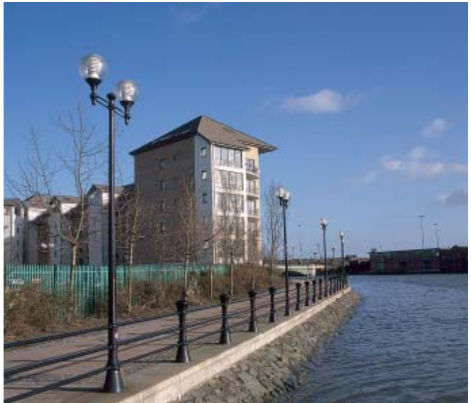
Belfast City Centre