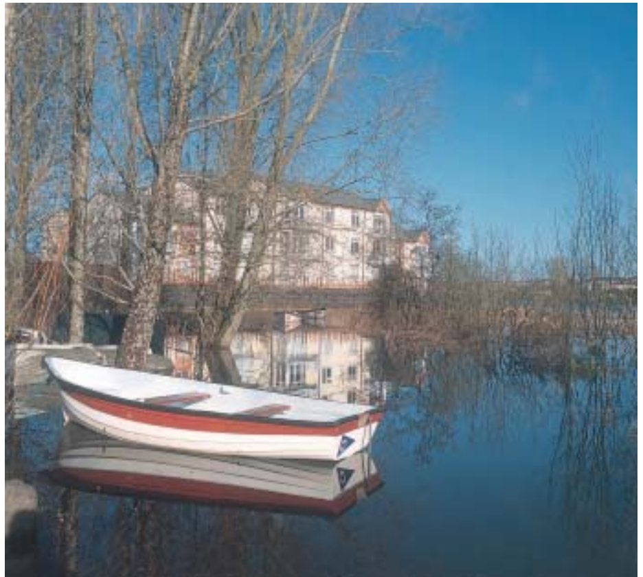
Housing which responds to the location and setting of the site. Enniskillen, County Fermanagh