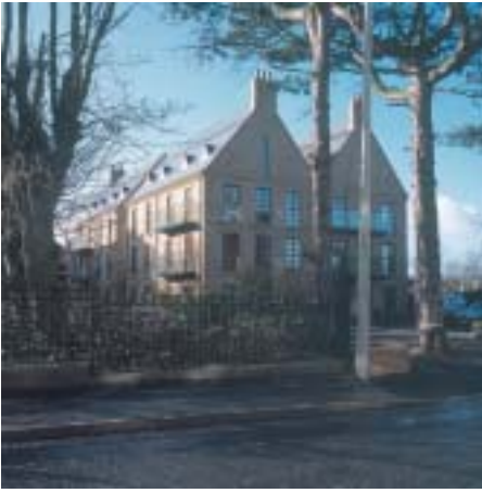
Fitting in with the local context. Holywood, County Down