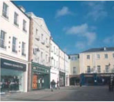
Apartments with basement car parking. Lisburn, County Antrim

It may be necessary to extend this analysis to include: