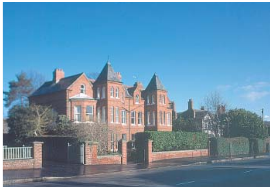
Quality established residential area. East Belfast