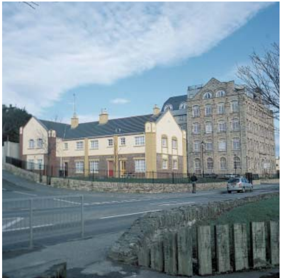
Redevelopment incorporating existing factory premises. Londonderry