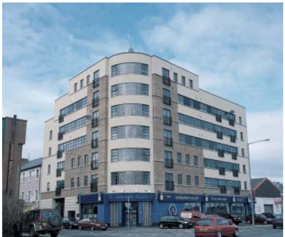
Well developed corner site. Londonderry