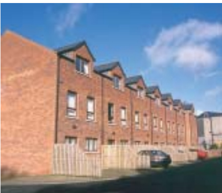
Rear courtyard car parking. South Belfast

3.43 Communal parking can also enable traditional boundary treatments such as walls, hedges and fences to be incorporated so providing a clear definition between the civic space of the street and the private realm of the dwelling. It is preferable for car parking to be located in an area within view of residents and which will benefit from appropriate natural surveillance.