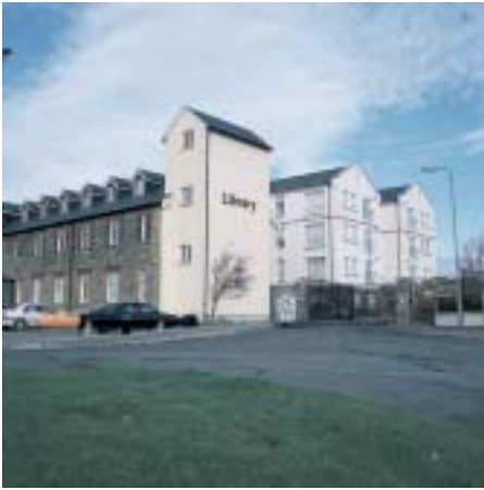
Infill housing which incorporates services and facilities. Londonderry

density of development and the configuration of built form in terms of the shape, height and grain of the building patterns, the use of materials, street and building lines, set backs and the space between buildings.