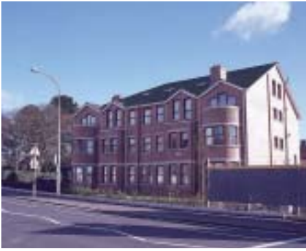
High density development resulting in a loss of garden space. South Belfast

4.4 The successful integration of new housing in established residential areas requires very sensitive urban design, landscape and architectural approaches. This is necessary in order to avoid the prospect of eroding, or even destroying, the character and qualities which make an area an attractive place to live and visit. The approach taken should: