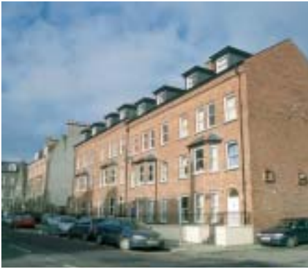
Sensitive development in a Conservation Area. Londonderry