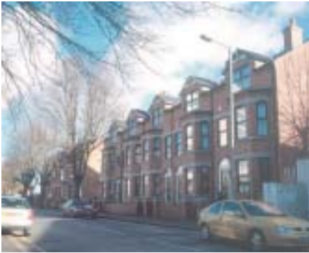
Development tailored to the local context. South Belfast

4.10 The Planning Service will want to see that the character and surroundings of the site have informed the development proposals. Any proposals for housing development within established residential areas must therefore be based on a sound understanding of the characteristics of the existing residential environment. Planning Service will expect applicants and designers to carry out an appraisal of the local context, which takes into account the character of the surrounding area.