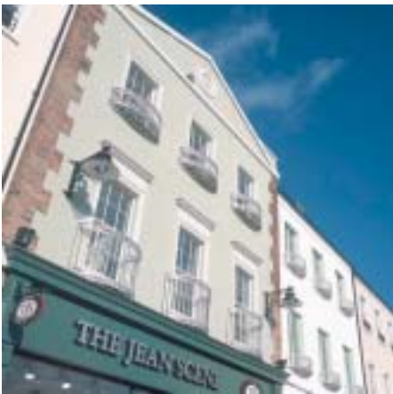
Lisburn, County Antrim