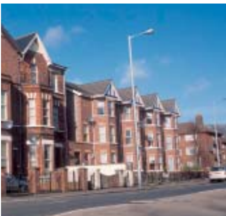
New housing which retains the building line and contributes to local character. North Belfast