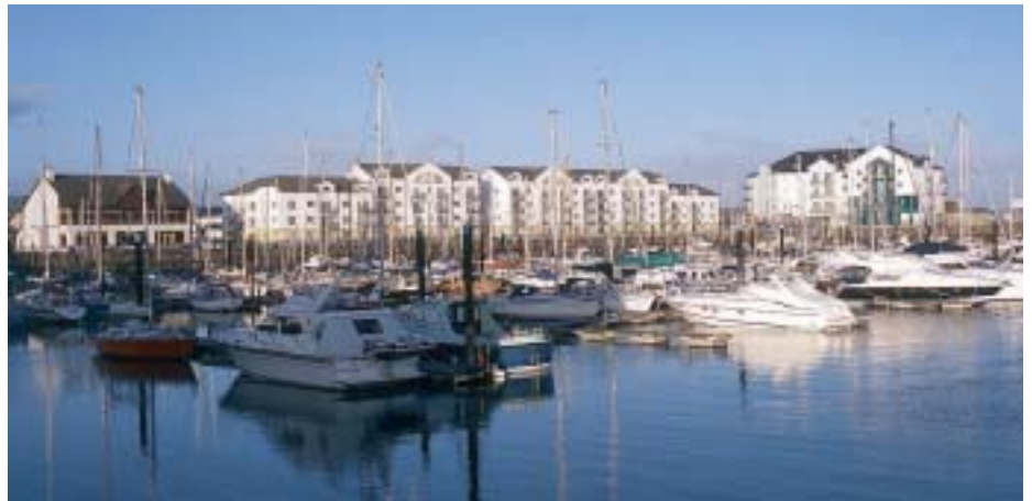
Carrickfergus, County Antrim