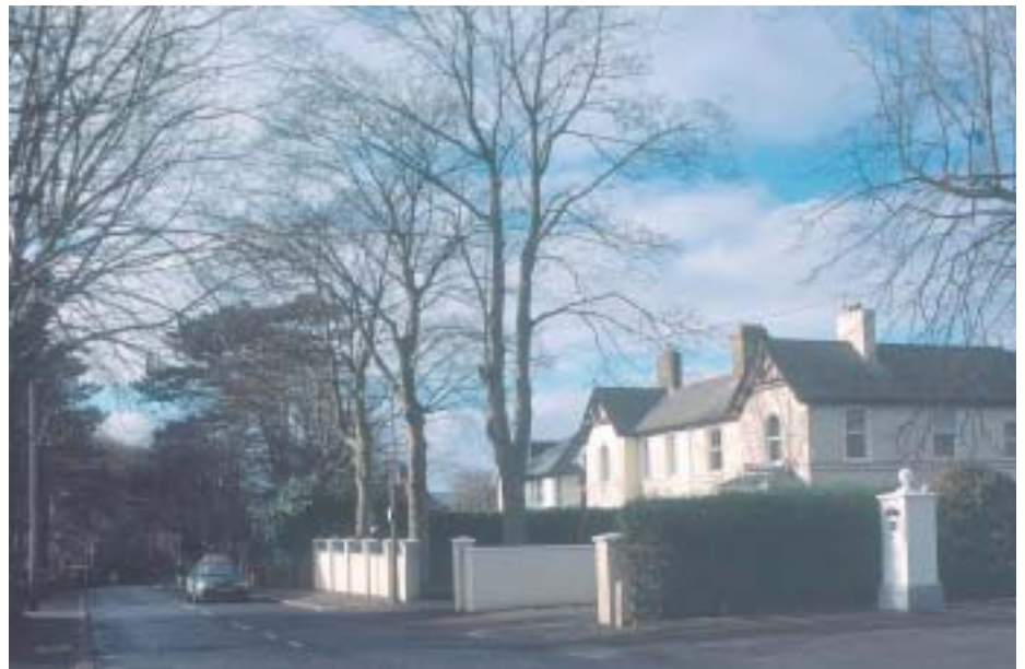
Appreciating the local residential environment. East Belfast

4.12 As referred to in Section 3, these requirements demand a design-led approach tailored to the local context, and the particular circumstances of the individual site and its surroundings. The use of standard house or apartment types will rarely provide an acceptable design solution. A key consideration is the need to respect the privacy of the occupants of residential properties, which are adjacent to the proposed development. A sensitive approach is also required in terms of highway design and the siting of car parking areas.