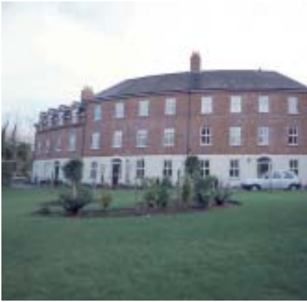
Quality landscape setting. East Belfast